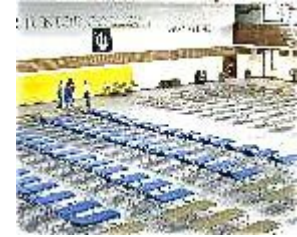
Beds in Gentry Gym

Regis client Tyler Junior College recently embraced an important principle of giving back to its community in the wake of hurricane Gustav, from August 30 through September 3. Then they did it again during hurricane Ike and its aftermath, from September 11 through the 21.